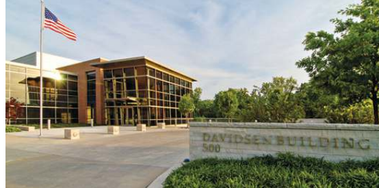
ACT headquarters in Iowa City.

ACT is an independent, not-for-profit organization that provides a broad array of assessment, research, information, and program management solutions in the areas of education and workforce development.